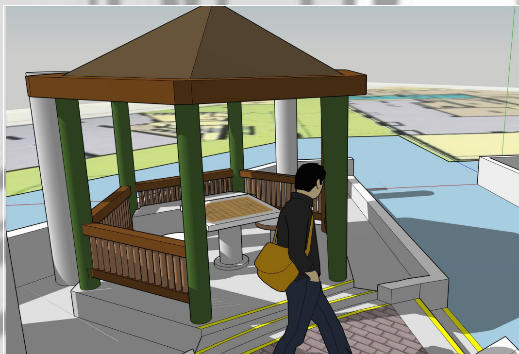
Rest Area 「休憩區」