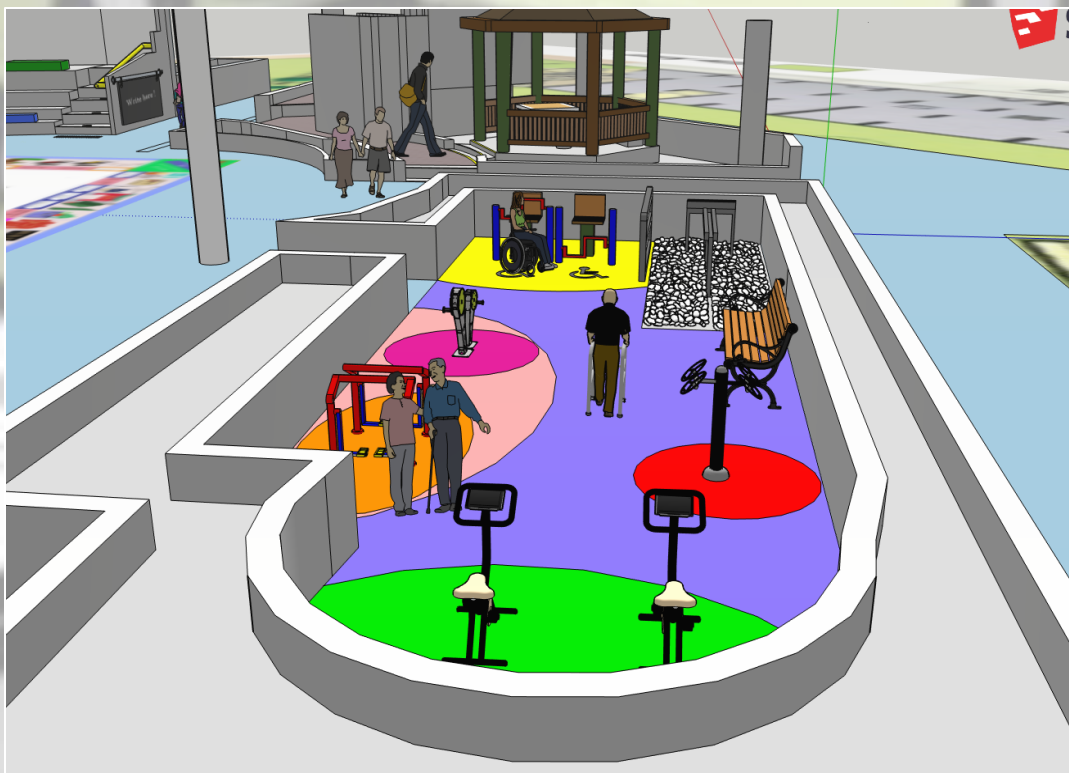
Elderly Area 「長者專區」